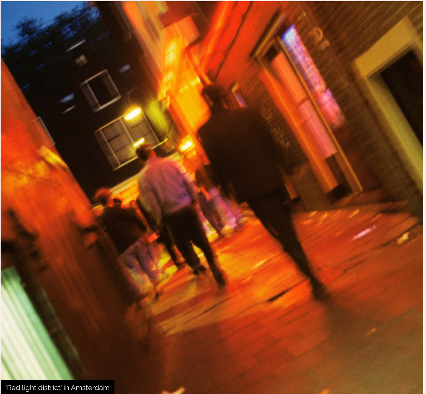
'Red light district' in Amsterdam