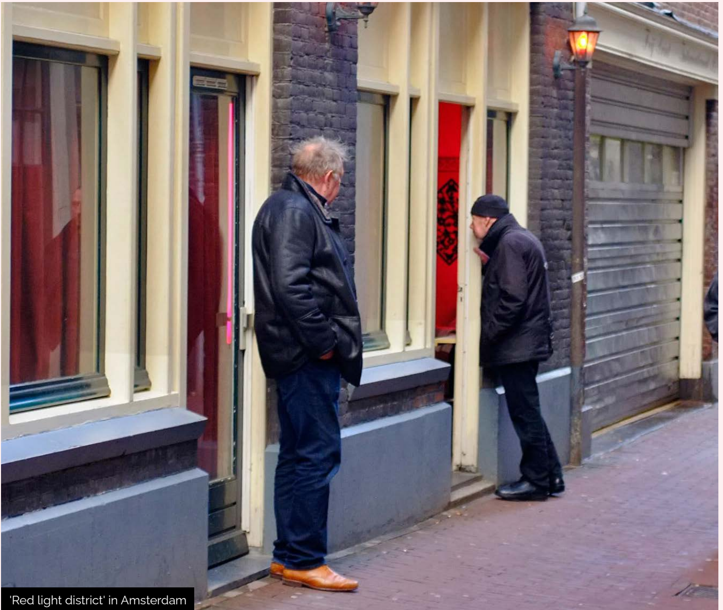
'Red light district' in Amsterdam

victims has its limitations. ...human trafficking is a financially motivated crime and traffickers seek as many clients as possible. This is best achieved by using the open web to which everyone has access. The dark web has several technological barriers that can reduce the overall marketplace, and thus it is not well-suited for increasing the numbers of clients, and is more geared towards buyers with niche interests, like in the cases of human trafficking for organ removal, and those trading in child sexual exploitation imagery. 73