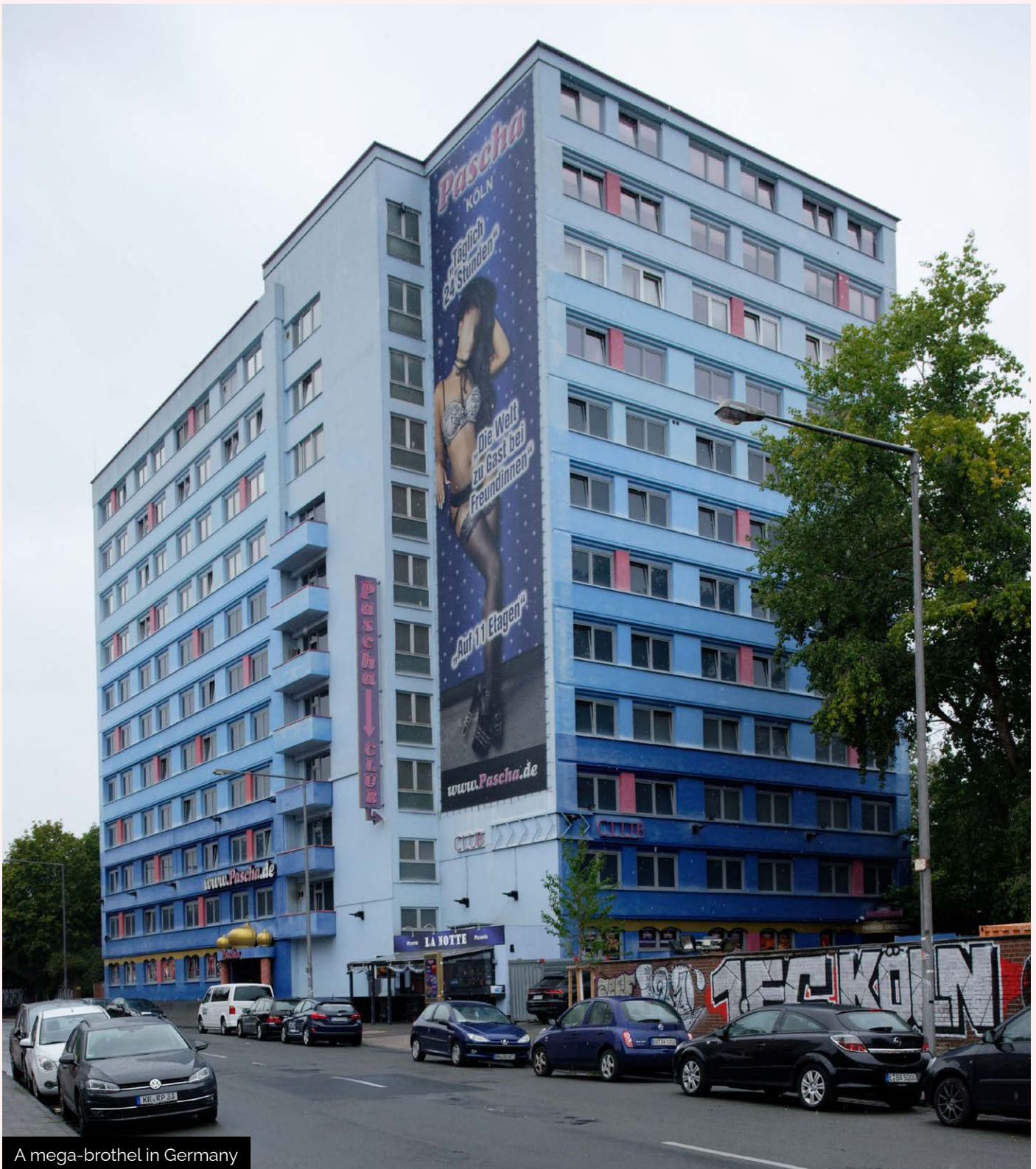
A mega-brothel in Germany

i The Netherlands lifted its general ban on pimping and brothel-keeping in 2000. The 'exploitation of involuntary prostitution' remained an offence. When Germany legalised the prostitution trade in 2001 it repealed the offence of the 'promotion of prostitution'. A new crime of 'exploitation of prostitutes' was introduced – designating a right and wrong way to organise and profit from the prostitution of another person. The wrong way, for example, could involve a pimp taking more than 50% of the earnings of a person paid for sex. [References: Prostitution in the Netherlands since the lifting of the brothel ban, A.L. Daalder, Research and Documentation Centre, 2007; Unprotected: How Legalizing Prostitution Has Failed, Spiegel Online International , 30 May 2013.]